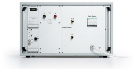
Power Line: Purest current up to 200 A

According to power ratings the current sources are built as air cooled or water cooled units. The current sources are supplied from the mains (single or three phase mains connection) or optionally from batteries.