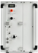
Compact Line: Ultra low noise current up to 20 A

The water chilled unipolar (UCS) and bipolar (BCS) current sources deliver up to hundreds of Amps with so far unprecedented precision and fast response. The constant low temperature of the water chilled power electronics results in extremely high stability and low noise figures. The Power-Series feature all comfortable control units. The operation of the Power-Series is just as easy as of any other of HighFinesse's current source.