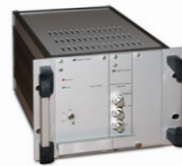
Milliamp Line: Compact and mobile up to 20 mA

The SMD-Series pushes the performance of the bipolar current source to the limits. With compact circuit boards and SMD components, the sources are reaching the lowest noise level and fastest response. The modular design allows the selection of operational units that are most important for the desired application, leaving out other modules. The sources can be supplied from the mains or from external batteries. Ideal for mobile systems. An optional manual control module and digital display make operation of the source easy also in standard lab applications.